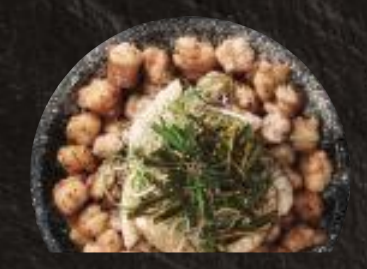
소대창구이 LARGE INTESTINE GUI Grilled beef large intestine