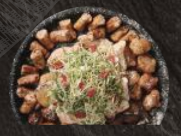
곱창모듬구01 ASSORTED GUI

Grilled beef heart and beef small, large intestine and entrails